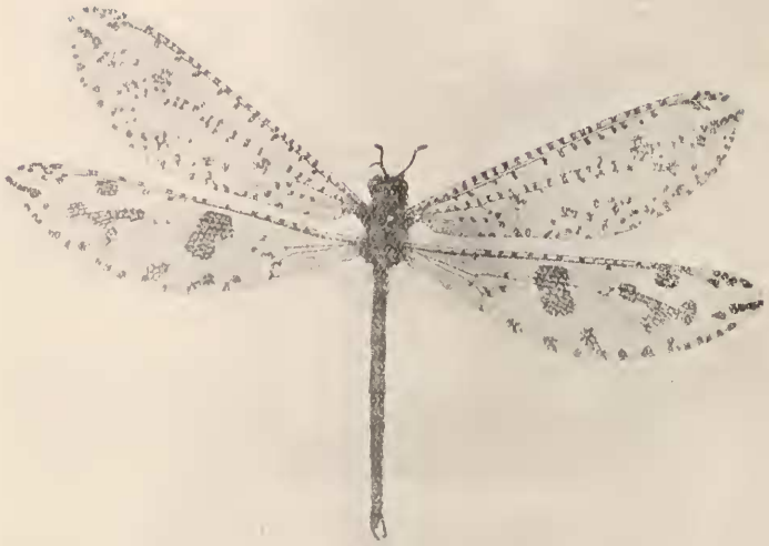
FIG. 1. PALPARES ÆMULUS.